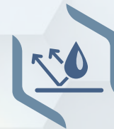
Resistance to alkalis up to pH13

Diamondbrite Ceramic is based on a Reactive Amino Functional Compound which cross links with the paint surface creating a tough impenetrable barrier.