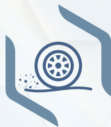
Road grime, salt, traffic film and tar