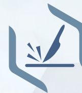
Increased scratch resistance