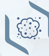
Dirt & grime