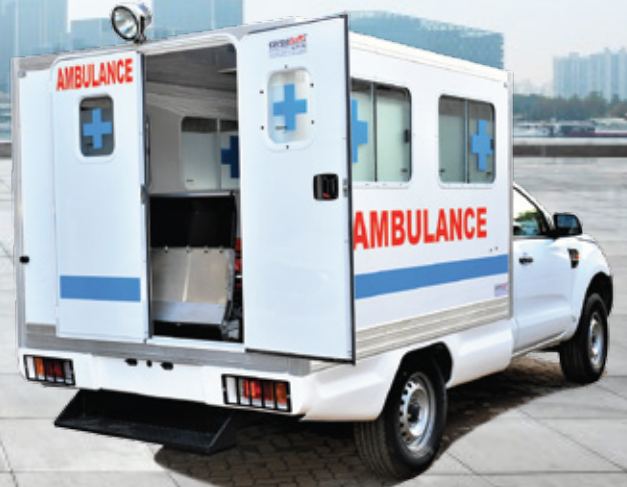
Van & Pick Up Conversion