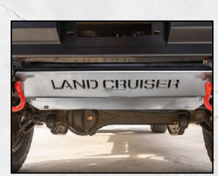
Sump guard plate