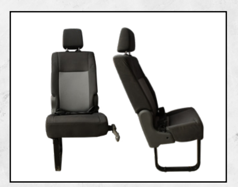
OEM seat (with headrest / reclining) SR-CB-HIA-ST