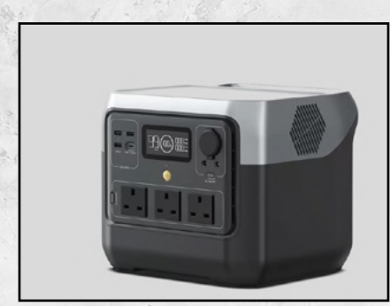
Portable power station