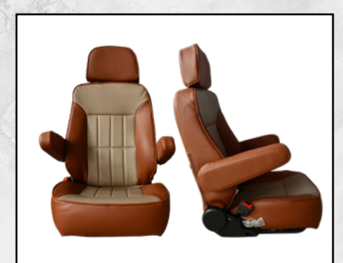
Savanna Supreme Seat (reclining/ fixed armrest)