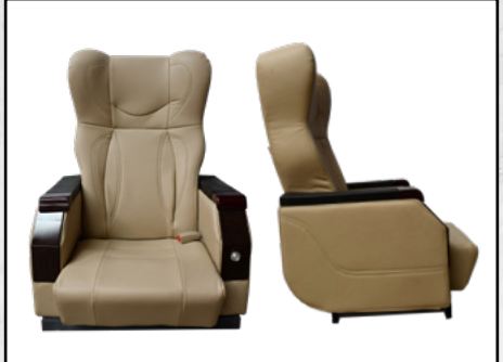
Voyager Elite Seat