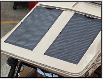
100W solar matt