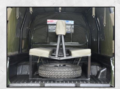
Back-to-back bench seat