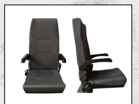
Pathfinder Flip-up Seat (double arm-rest) SR-ST-HC-PFLP-DY04