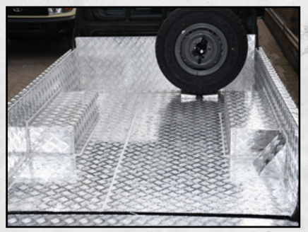
Checker plate bed cladding