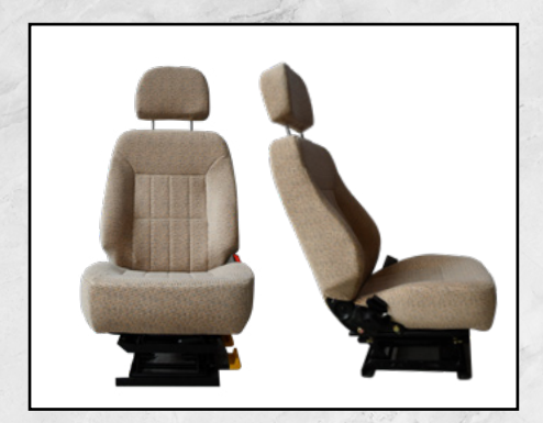
Oasis Recliner Seat (with height adjust) SR-ST-HC-PSUD-JS-08B