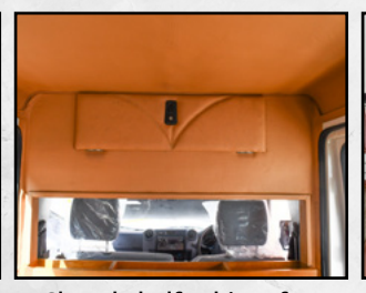
Closed-shelf cabinet for onboard storage