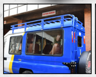
Roof storage rack