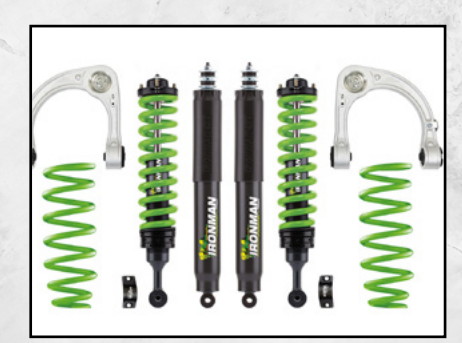
Ironman4x4 offroad suspension